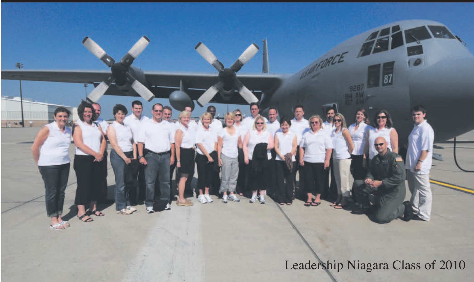
Leadership Niagara Class of 2010